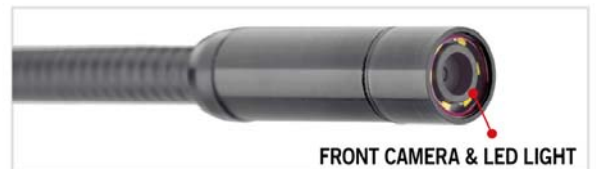
FRONT CAMERA & LED LIGHT